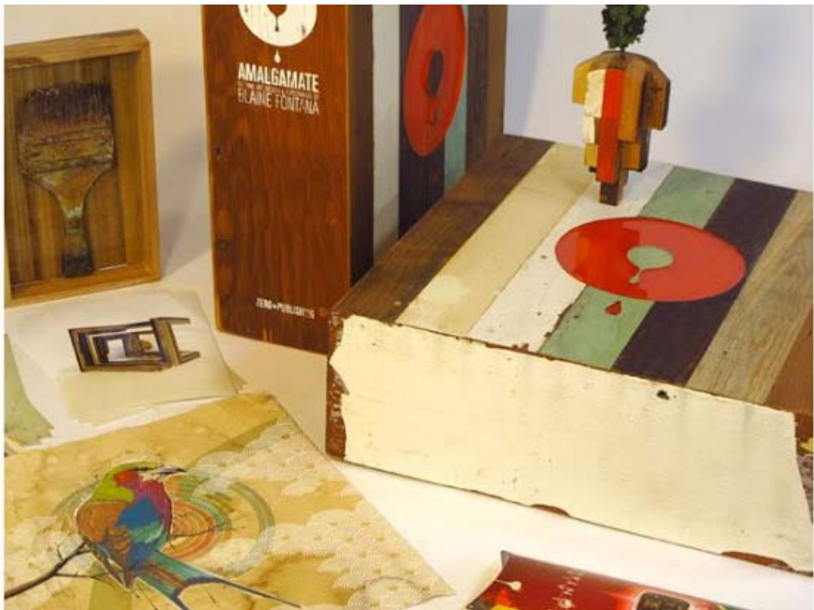
BLAINE FONTANA: AMALGAMATE DELUXE BOXED EDITION (Edition 10 / 2 AP) Box was hand-made by the artist with reclaimed wood and the cover has a CNC routed logo with cast resin – signed/numbered. 14 x 14 x 4.5" (35.5 x 35.5 x 11.43cm) / 14lbs. (6.35kg) Contents: Signed/numbered/embossed book - 11.25 x 11.25" (28.6 x 28.6cm), Hand-finished signed/numbered six-color silkscreen print – 11 x 11" (27.94 x 27.94cm), Vannen/Fontana watch, 6 – 6 x 8" postcards, Mini wood sculpture (signed/numbered) – approximately 9" tall (22.86cm), Retired brush cast in resin box, Giclee print (signed/numbered) – 11 x 11" (27.94 x 27.94cm), COA

I told him we would print 1000 copies total, using the best paper we could get and that he would have a lot of control over what the end product would be. Most publishers give the artist no control. That's one of the things I love about publishing. You're working collaboratively with artists and there is a flow of creativity. It's a great process. As an artist you're often working in your studio in isolation, but as a publisher you're constantly in communication with other artists. I like that very much.